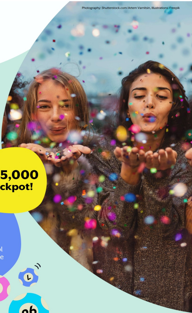
Illustrations: Freepik